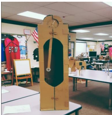
Clock created by student at Knox Gifted Academy in Arizona